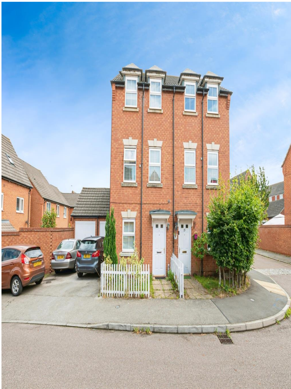
Jackdaw Road, Corby NN18 8RY