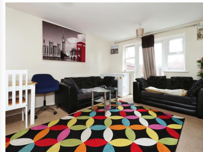
Siskin Close, Corby NN18 8RQ