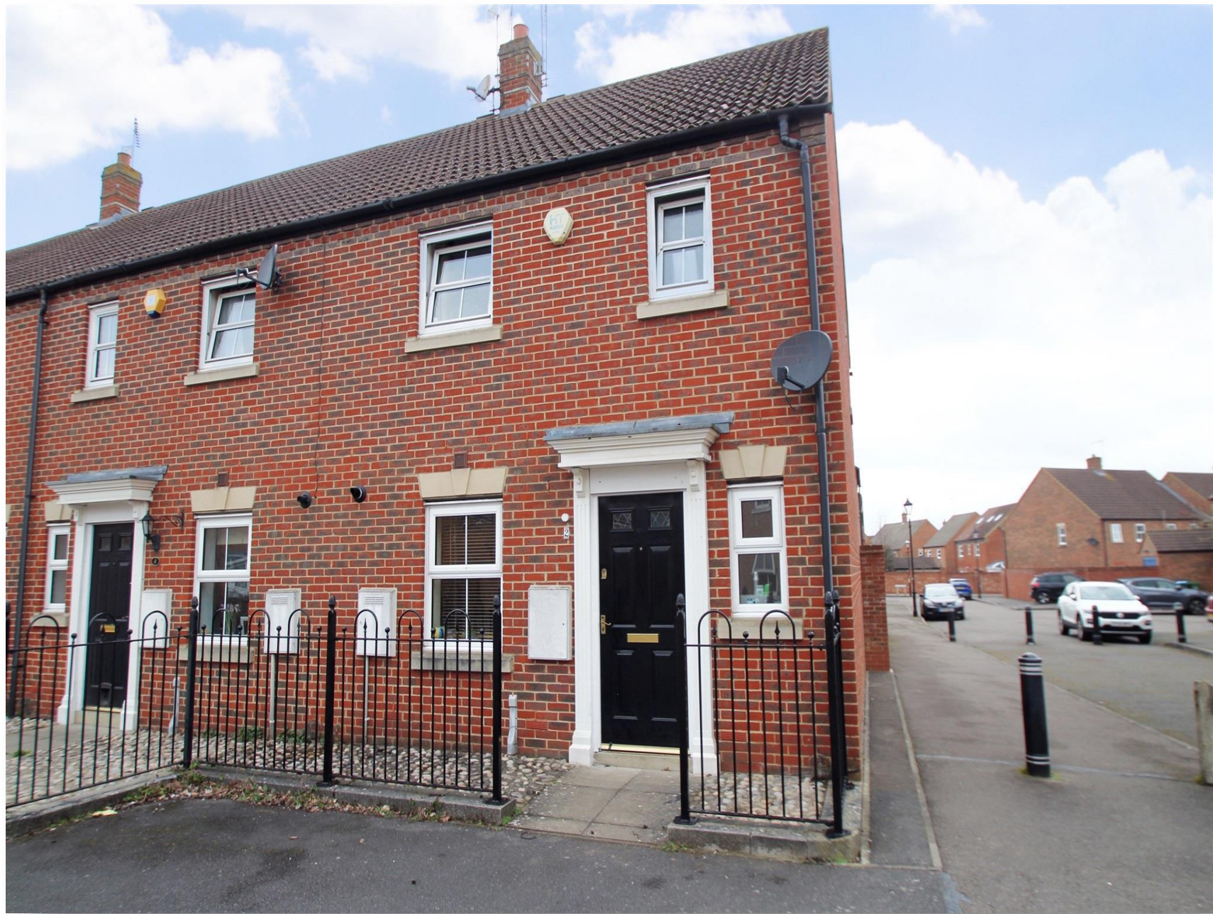
Firecrest Way, Fairford Leys Aylesbury HP19 7HD