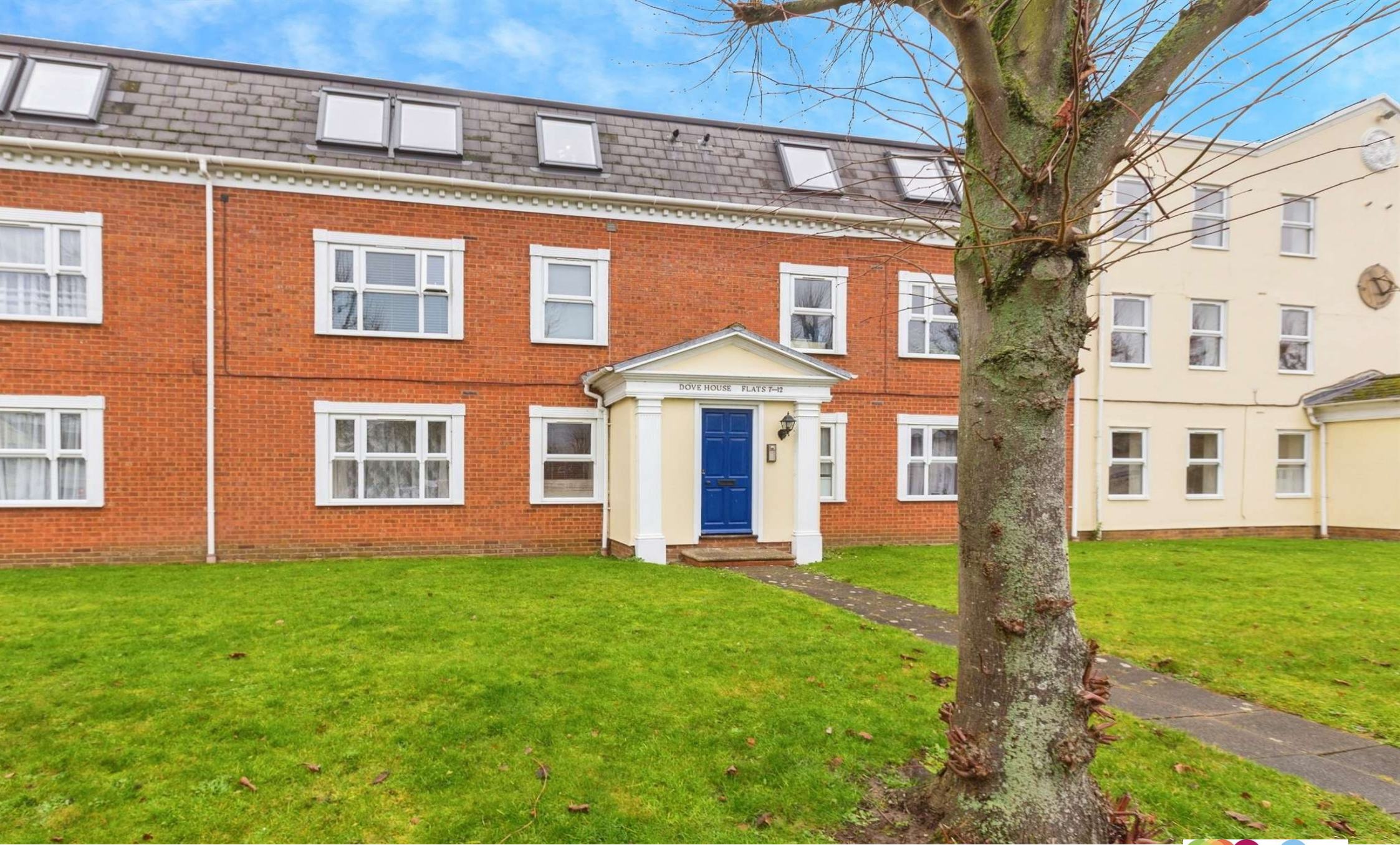
Dove House Dove Place, Aylesbury HP19 0GD