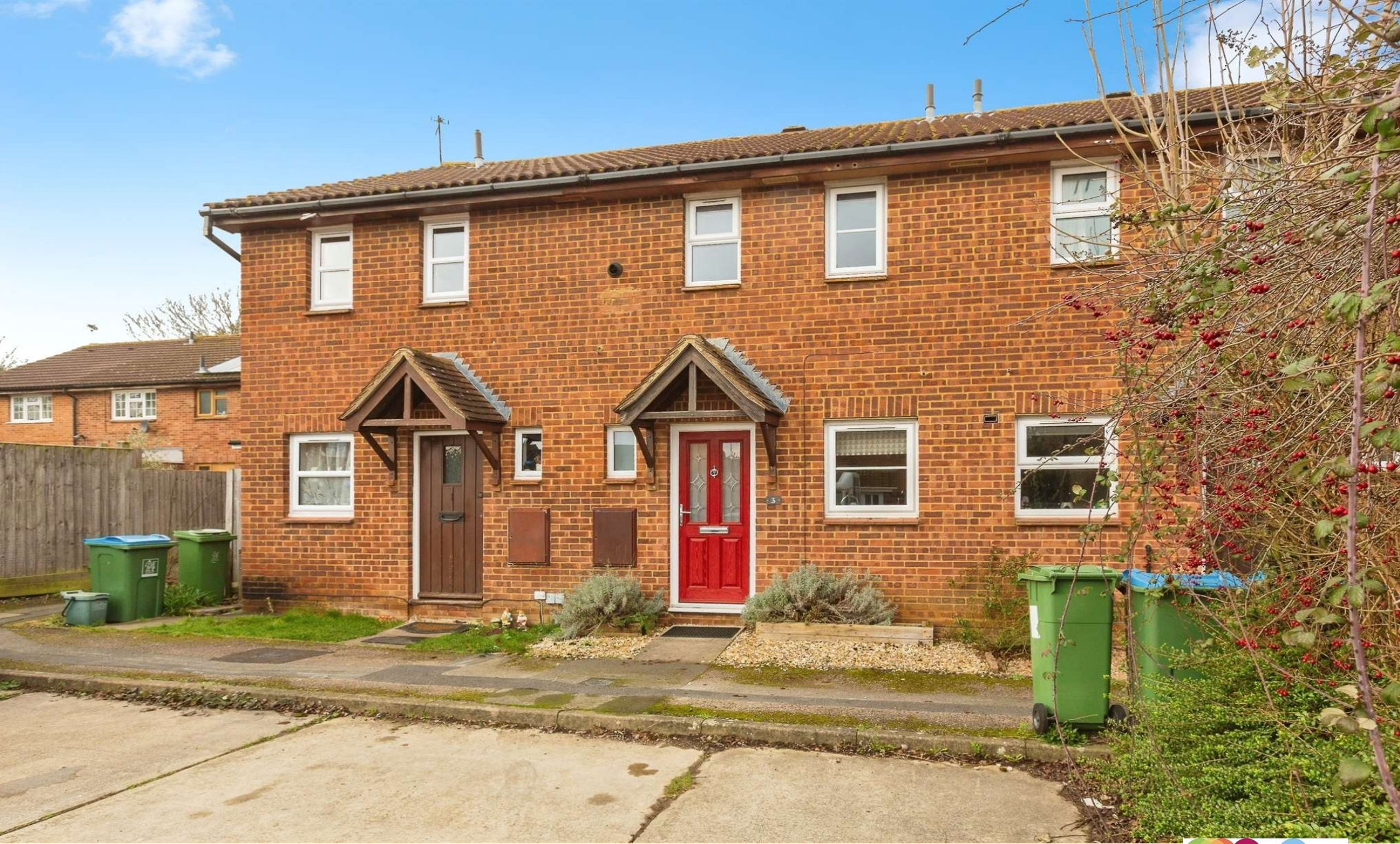
Coppice Close, The Coppice Aylesbury HP20 1XT