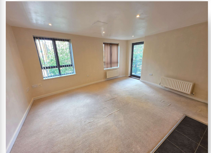
Buckingham Court Buckingham Street, Aylesbury HP20 2LL