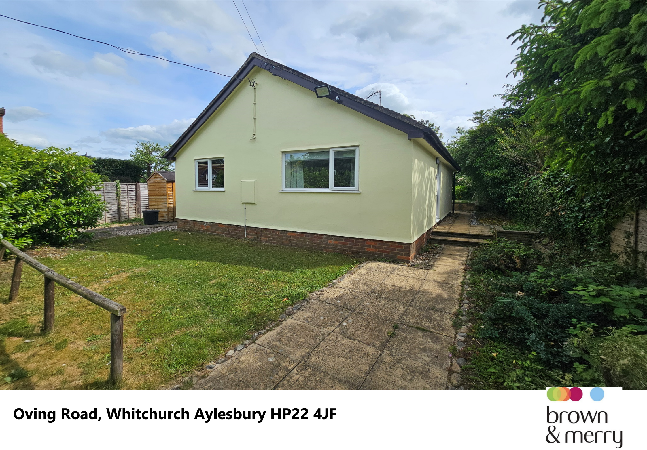
Oving Road, Whitchurch Aylesbury HP22 4JF