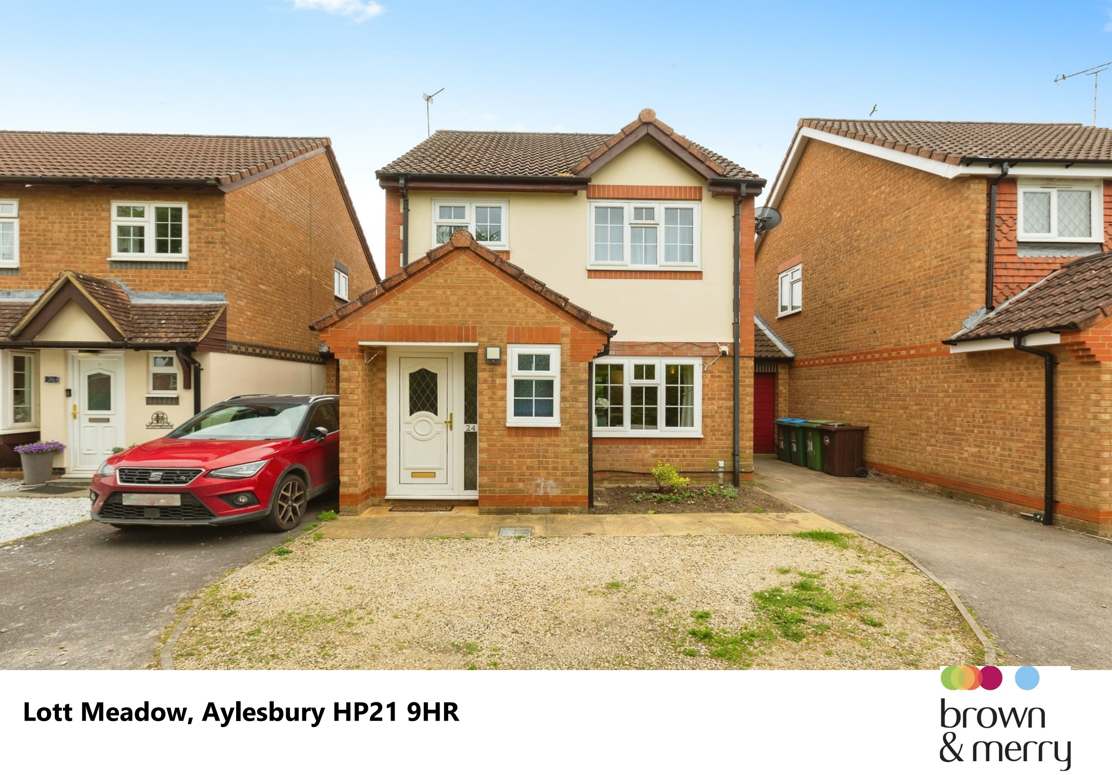
Lott Meadow, Aylesbury HP21 9HR