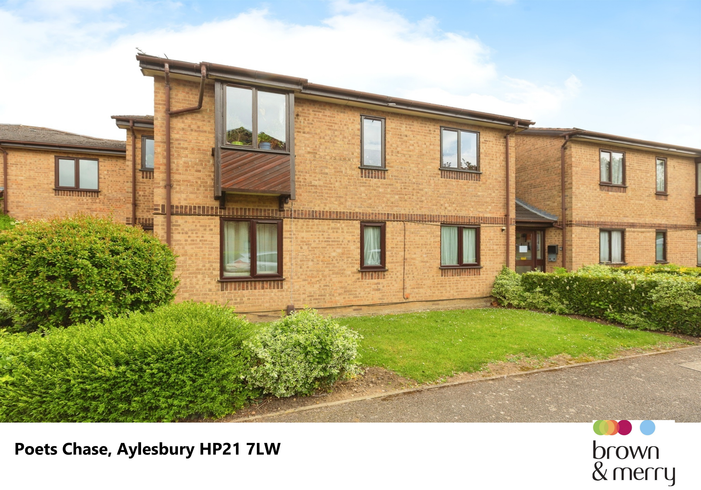
Poets Chase, Aylesbury HP21 7LW