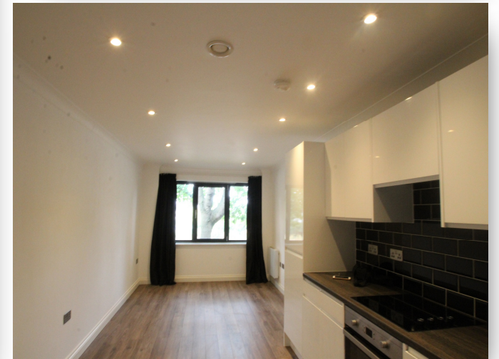
Friary Court, Aylesbury HP20 2FU