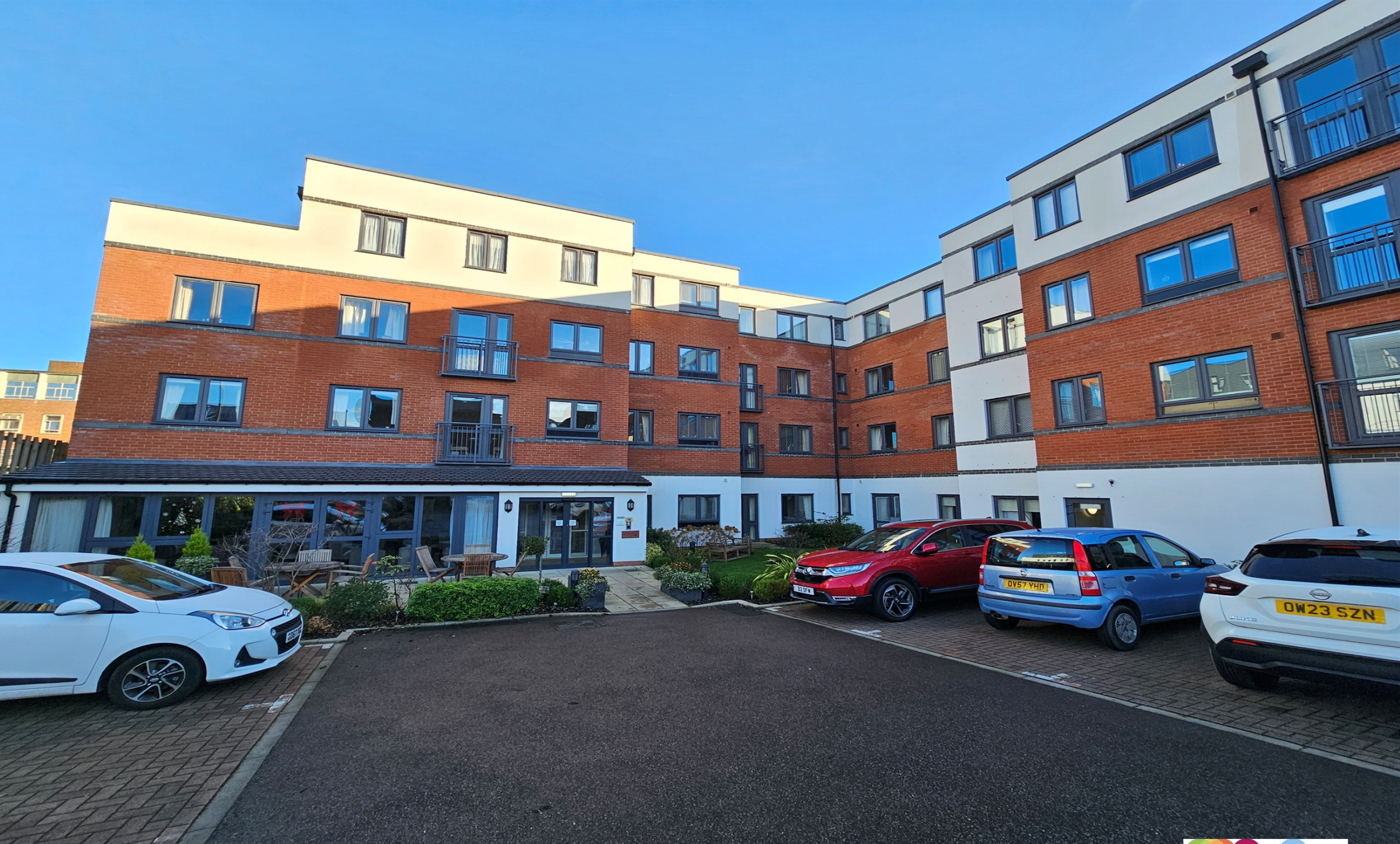
Oscar Lodge Cambridge Street, Aylesbury HP20 1FN