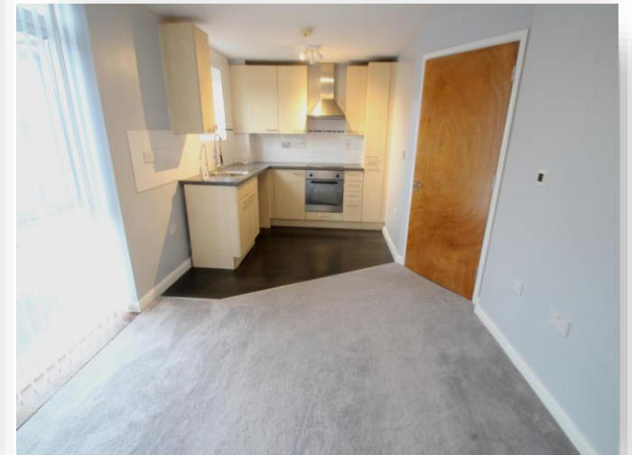
Kerr Place, Aylesbury HP21 7BB