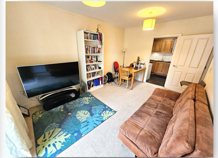
Stanton House Coxhill Way, Aylesbury HP21 8FW