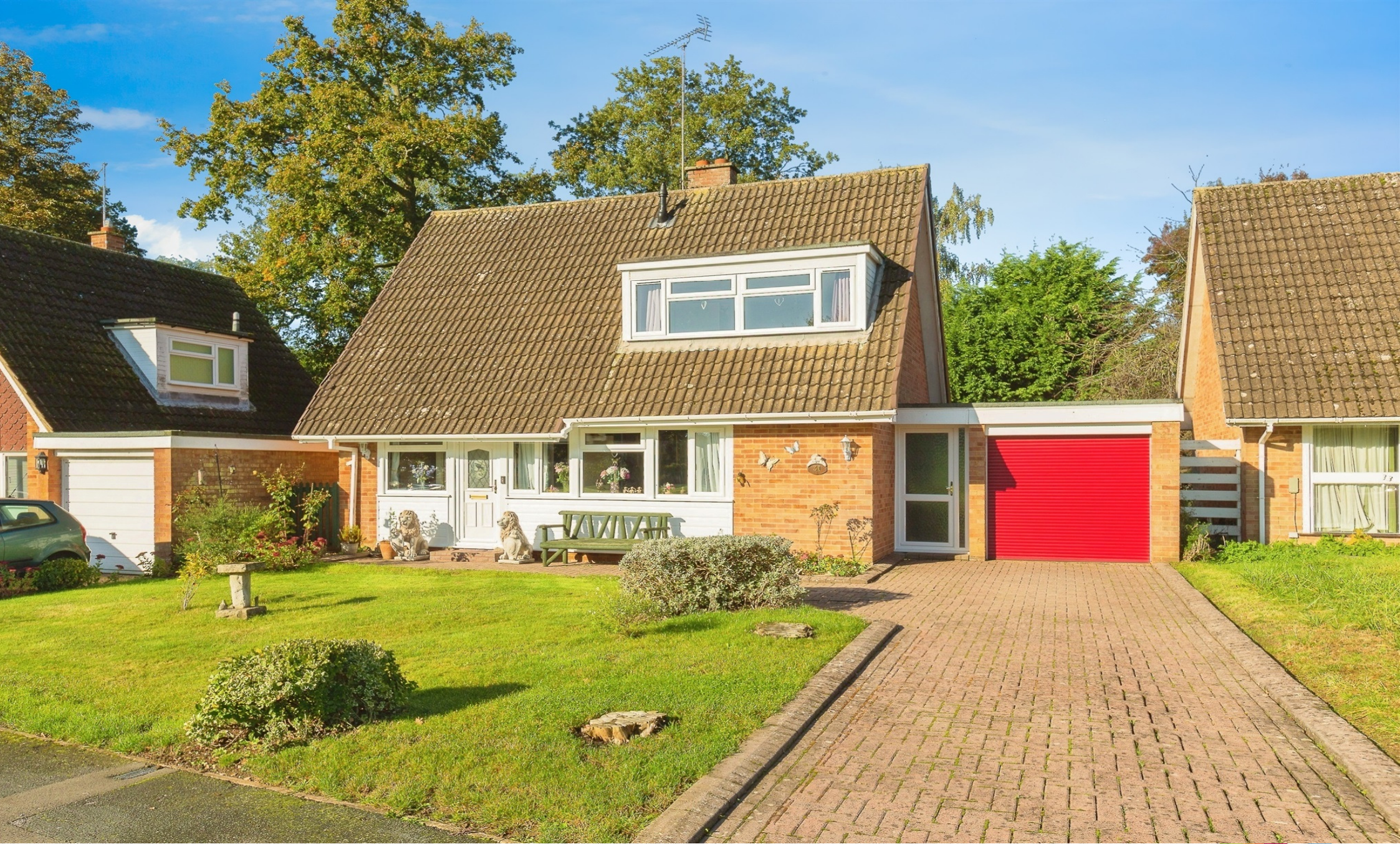
Fairmeadow, Winslow Buckingham MK18 3JB