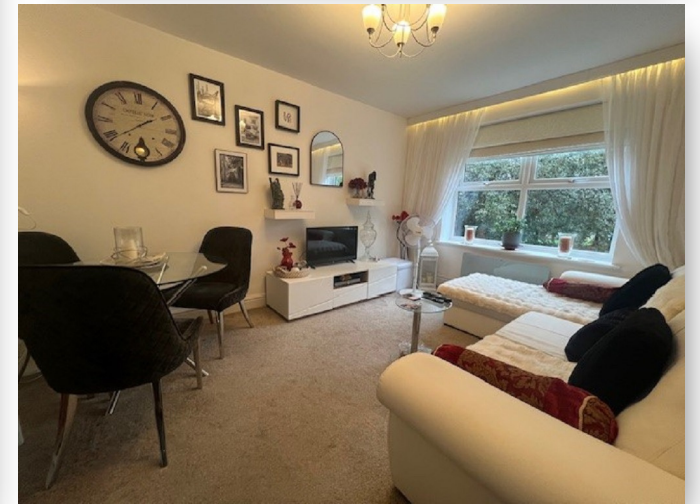
Whinchat, Aylesbury HP19 0WA