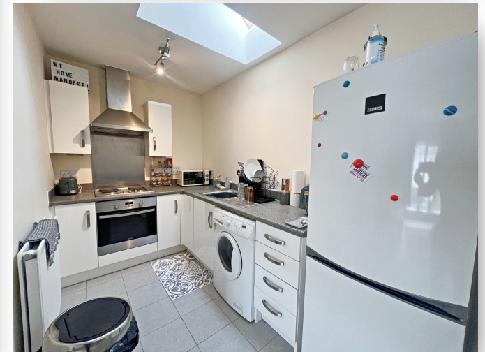
Avalon Street, Aylesbury HP18 0GS