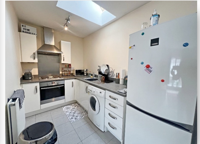
Avalon Street, Aylesbury HP18 0GS