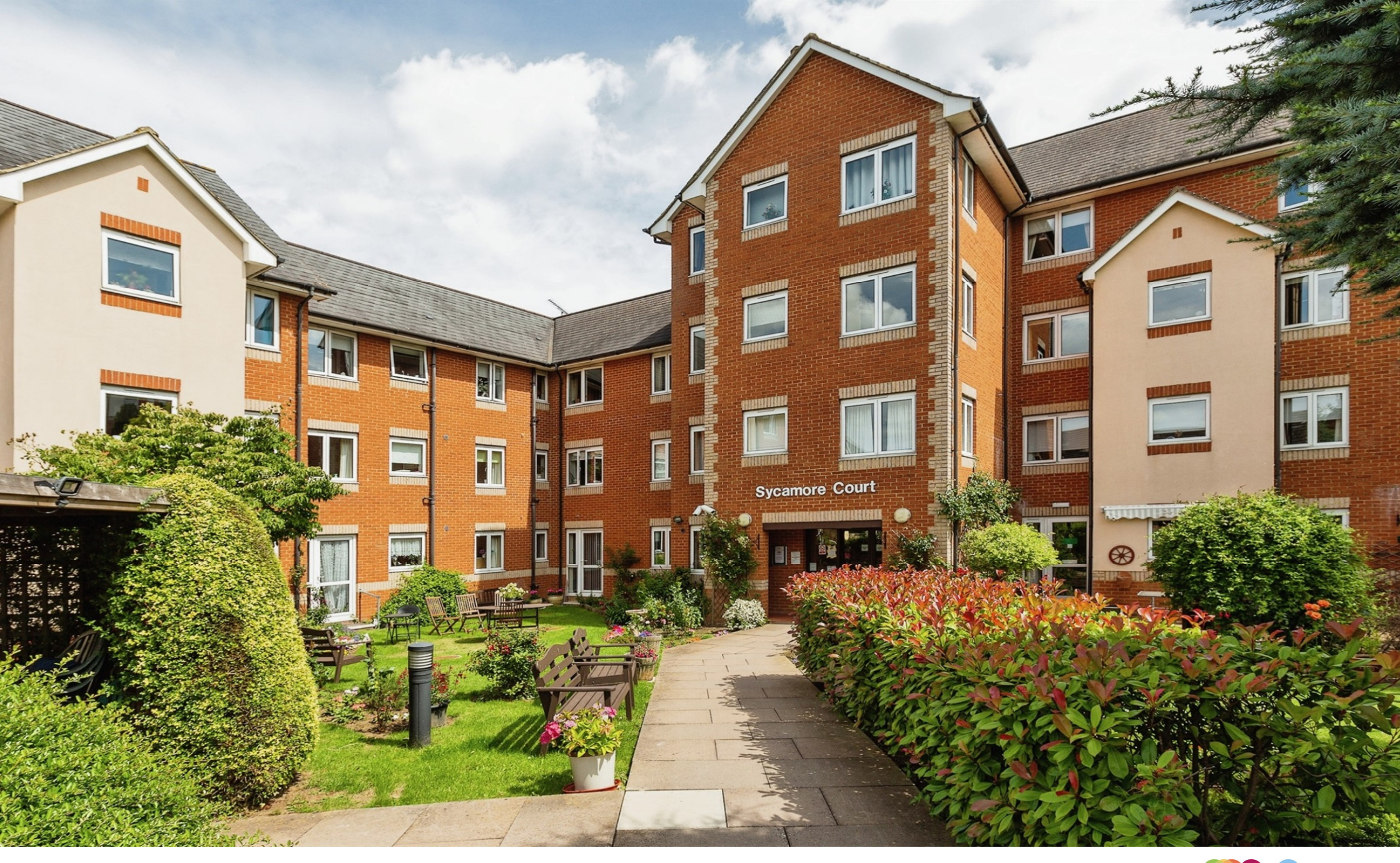
Sycamore Court Willow Road, Aylesbury HP19 9SZ