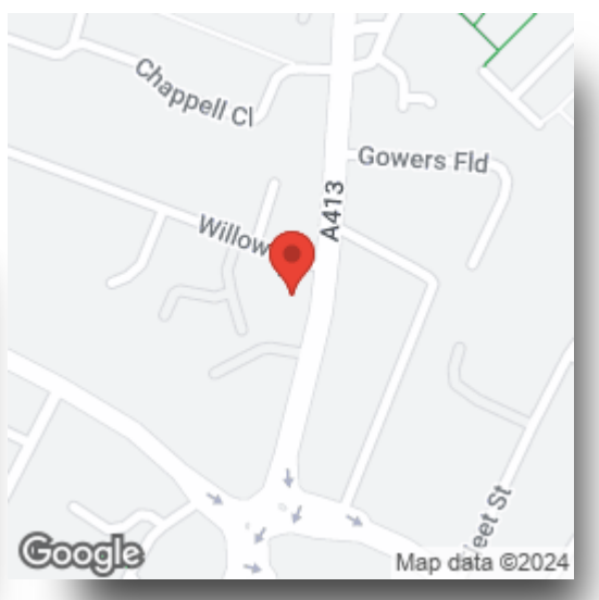
Please note the marker reflects the postcode not the actual property