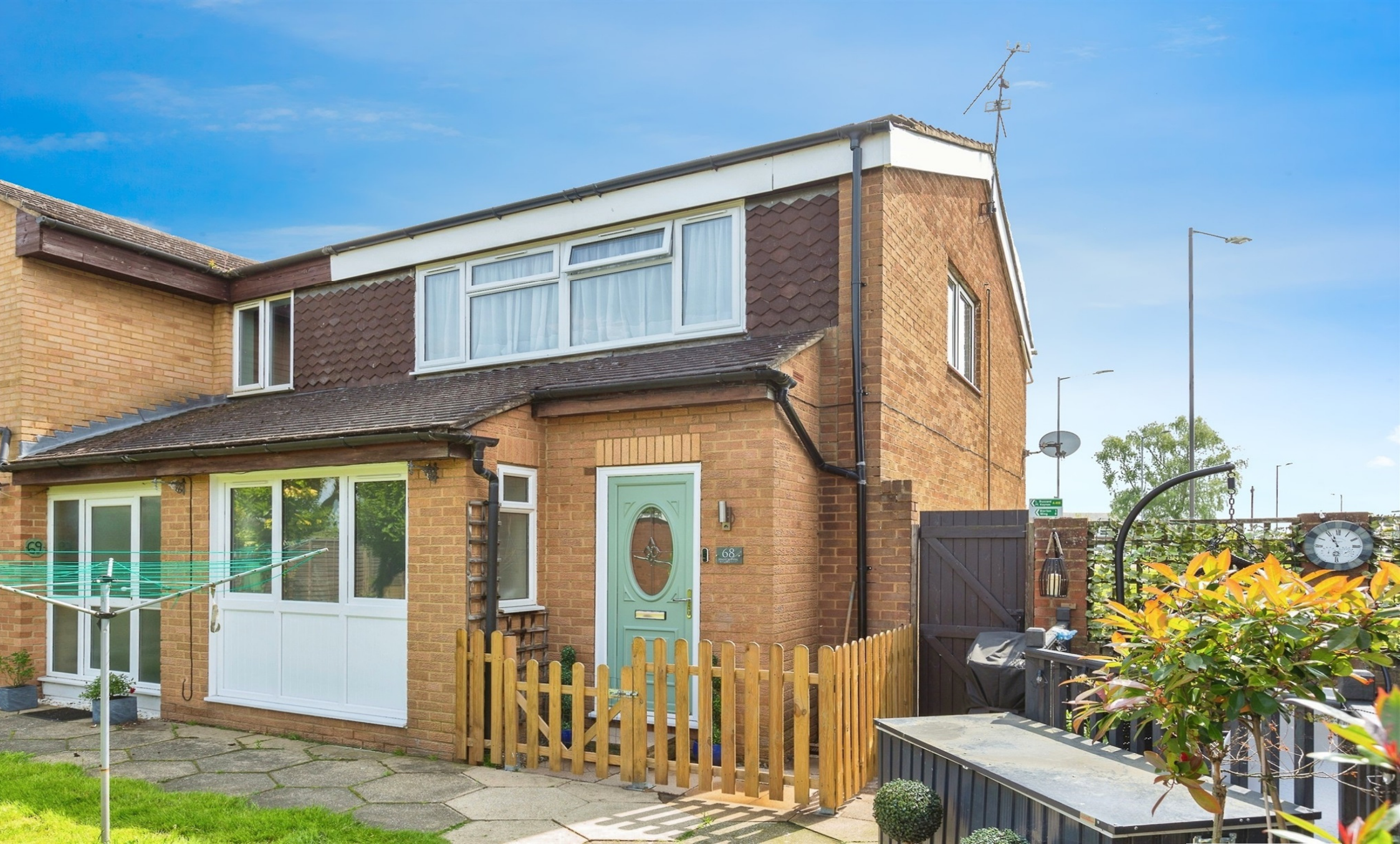
Hastoe Park, AYLESBURY HP20 2AA