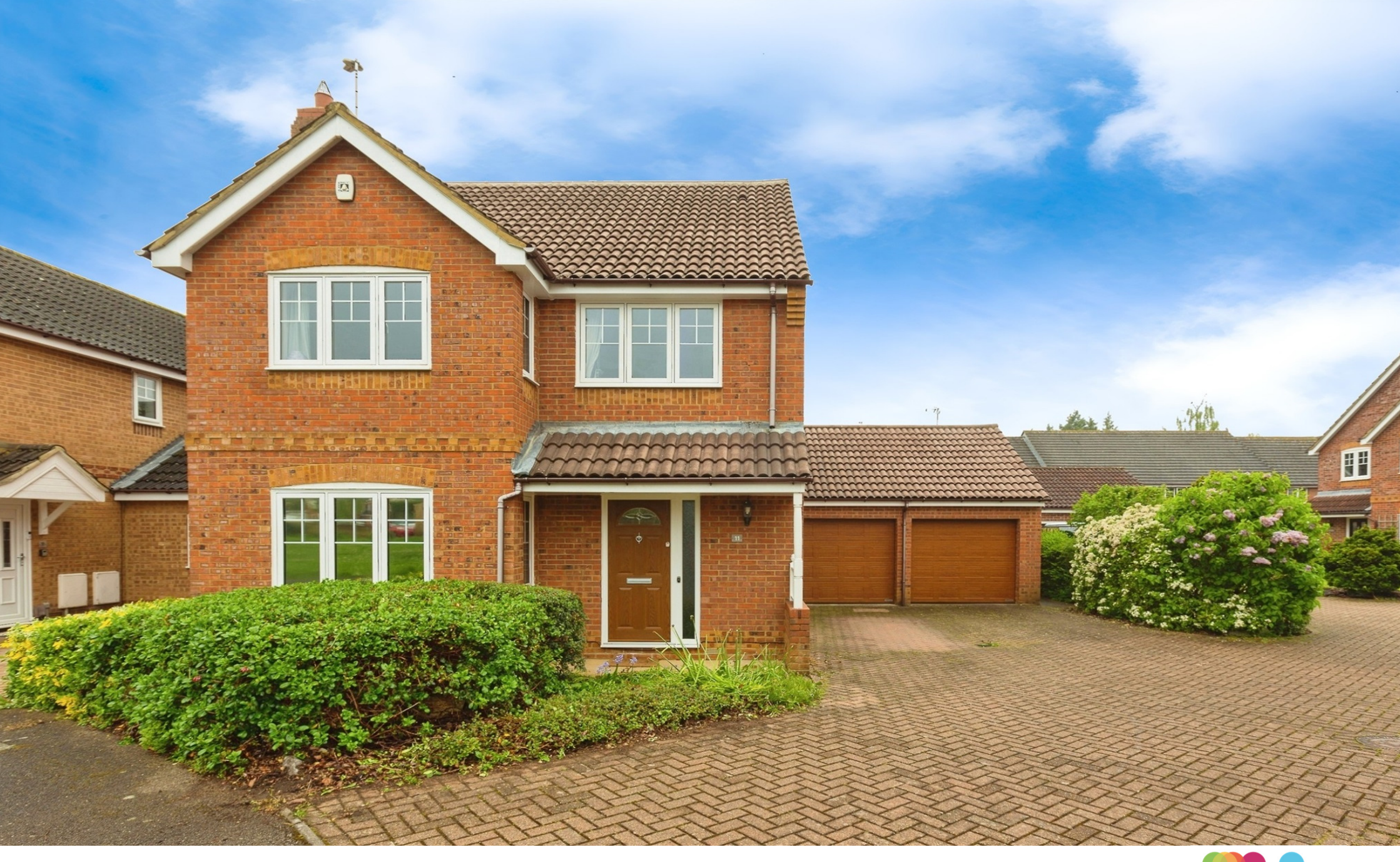
Holly Drive, Lavender Grange Aylesbury HP21 8TZ