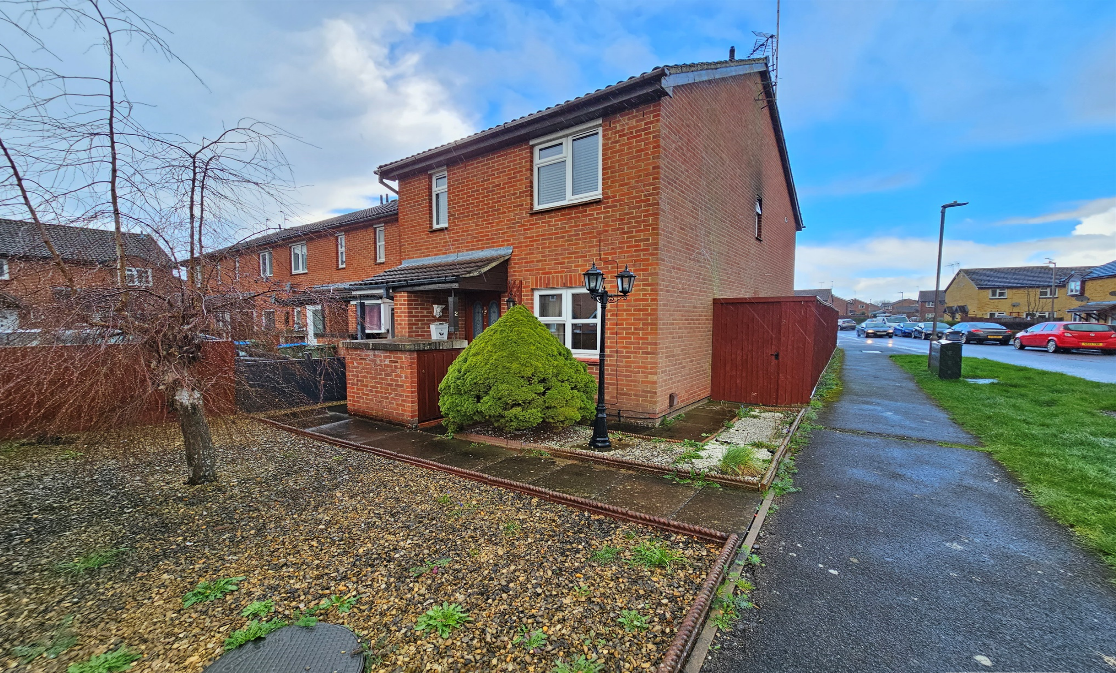
The Dell, Coppice Aylesbury HP20 1YP