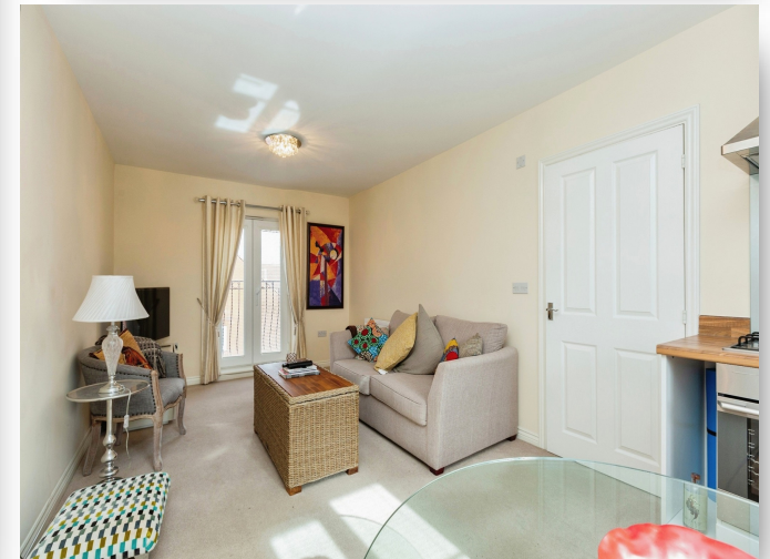
Prince Rupert Drive, Aylesbury HP19 9RA