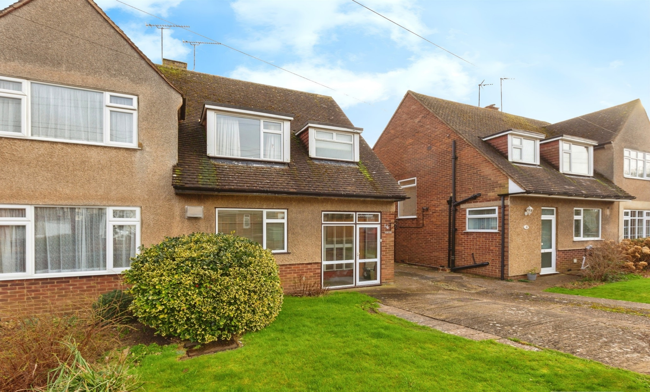
Burcott Close, Berton AYLESBURY HP22 5DH