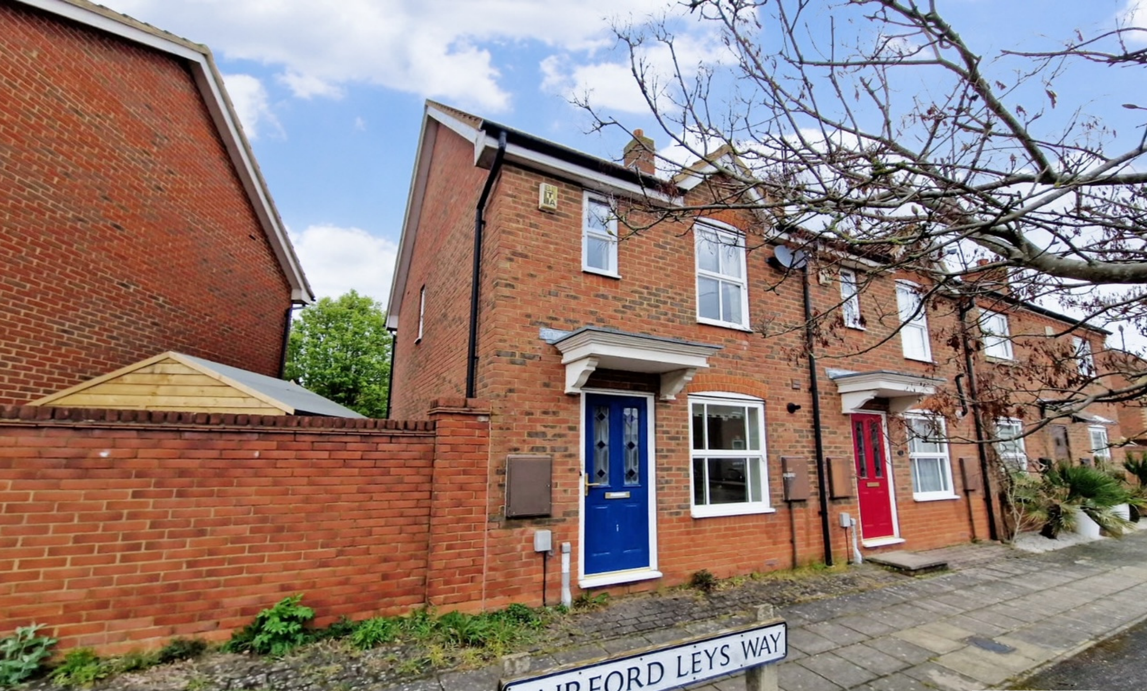
Fairford Leys Way, Fairford Leys Aylesbury HP19 7FQ