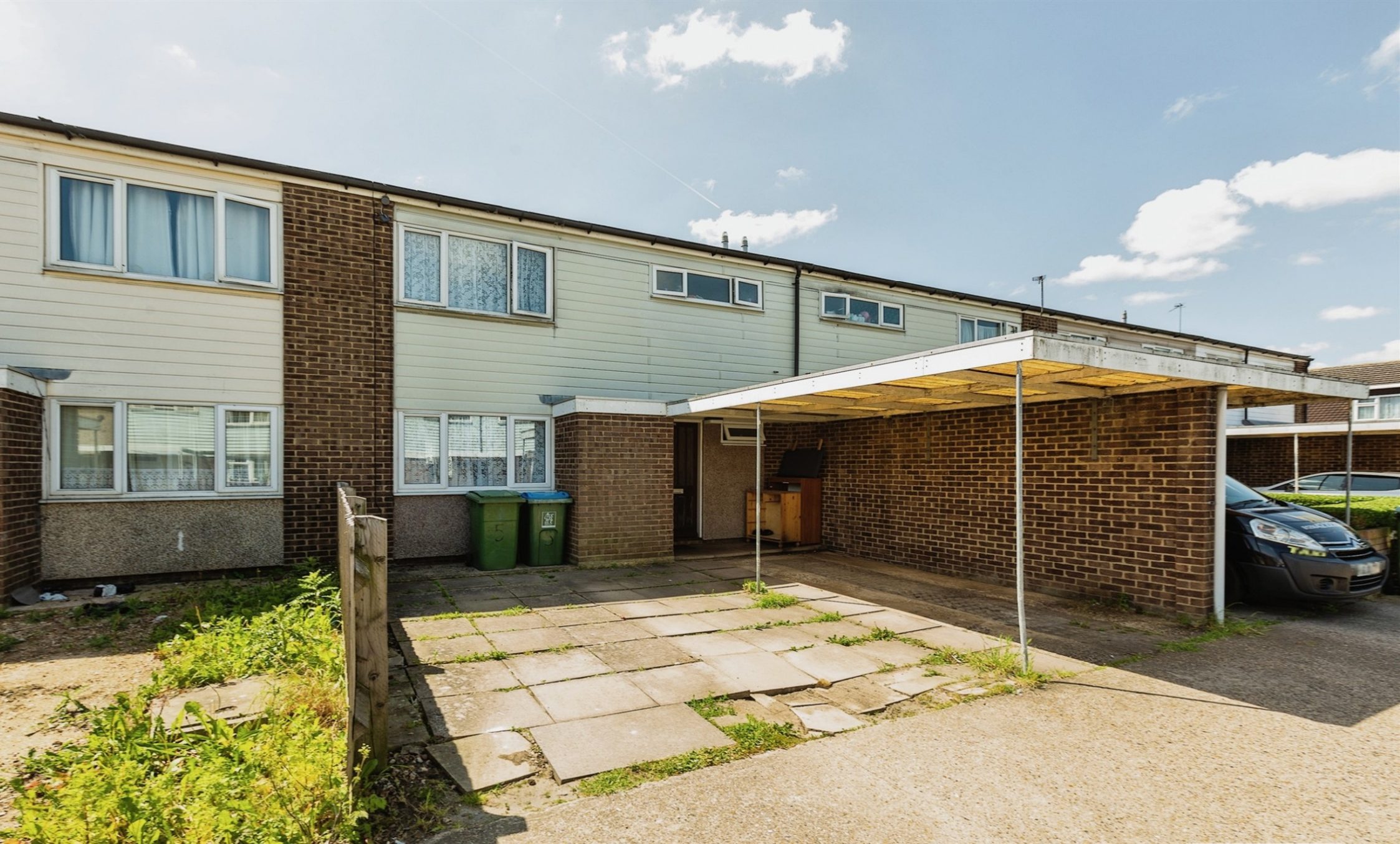
Stephenson Close, Prebendal Farm Aylesbury HP19 7QU