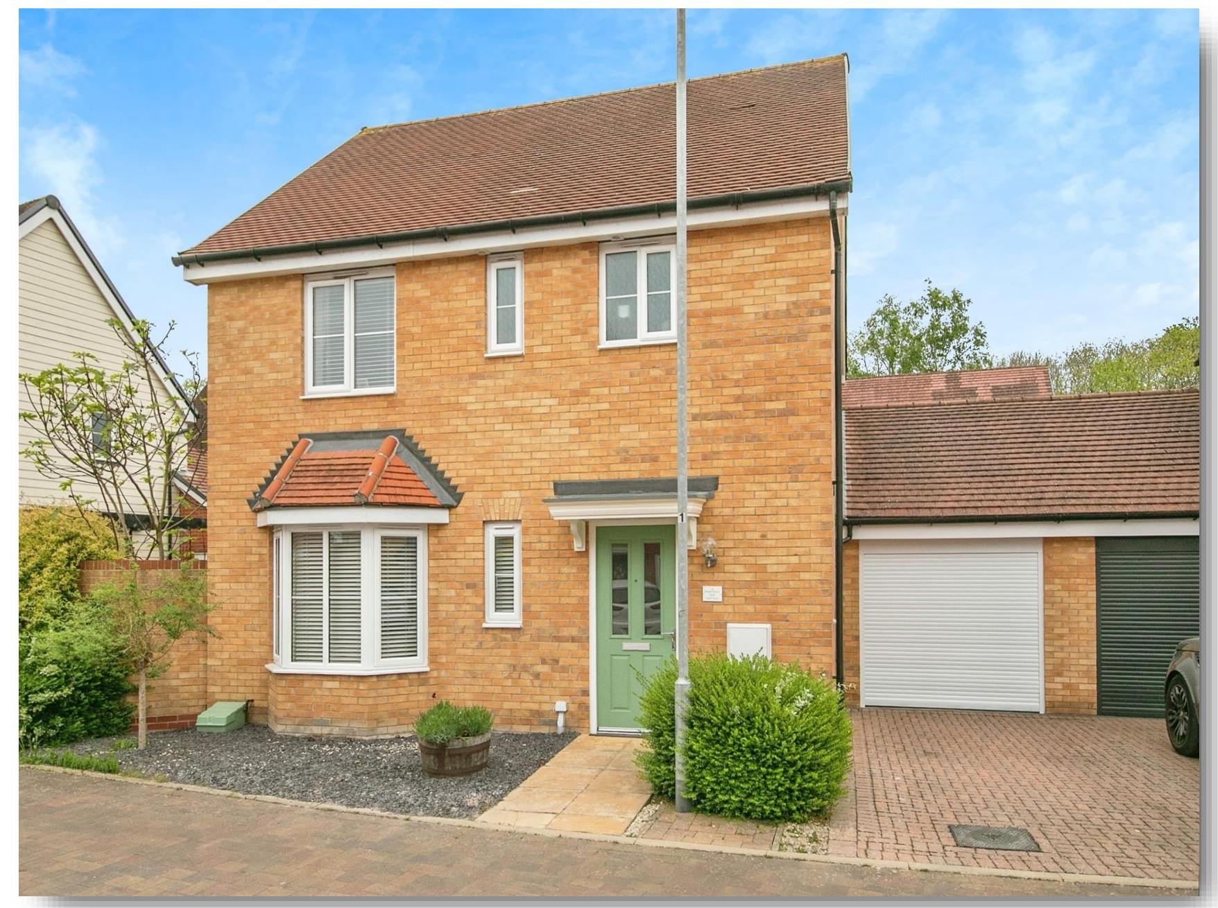
Ernest Fancy Lane, Colchester, CO4 9AN