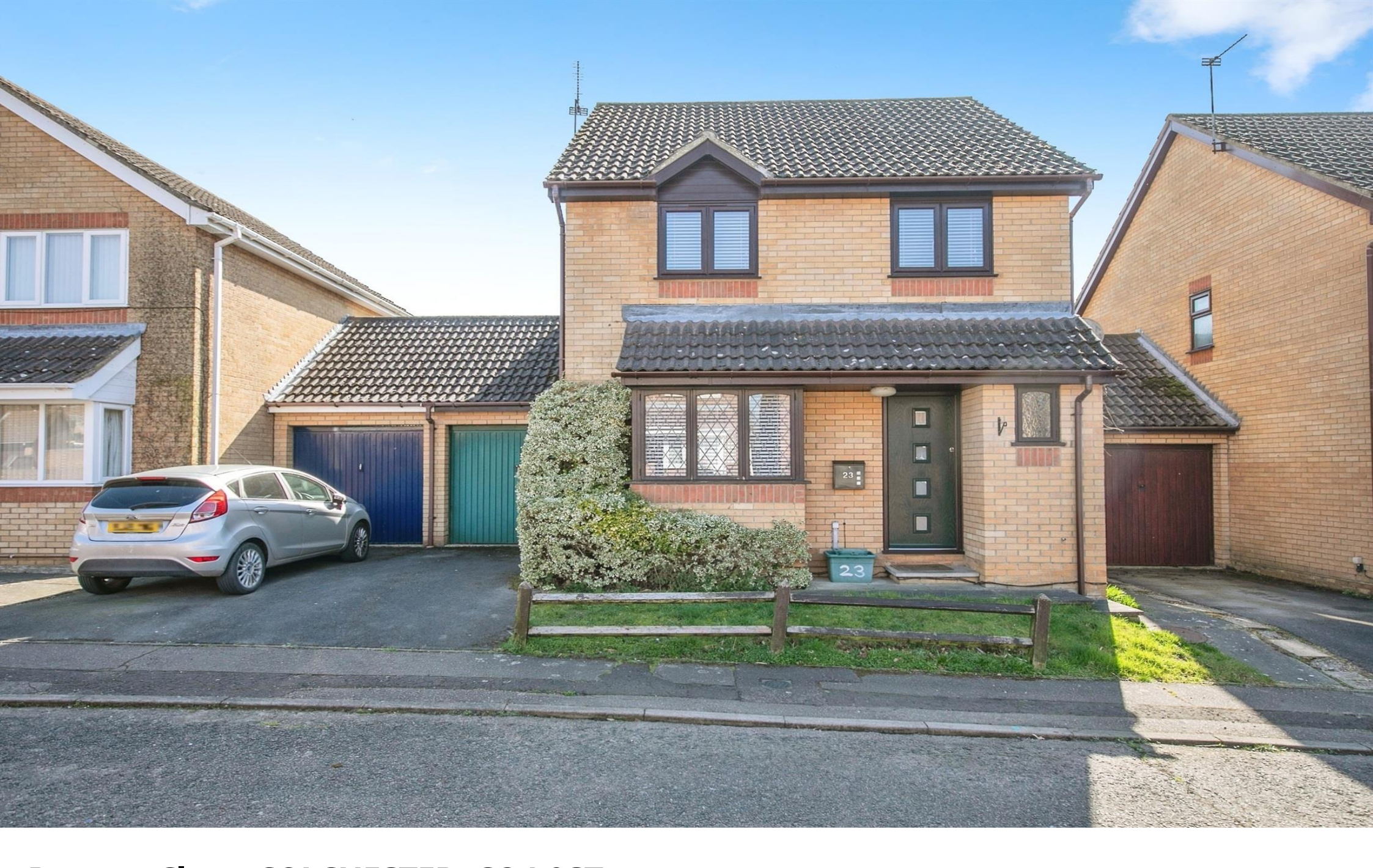
Pampas Close, COLCHESTER, CO4 9ST