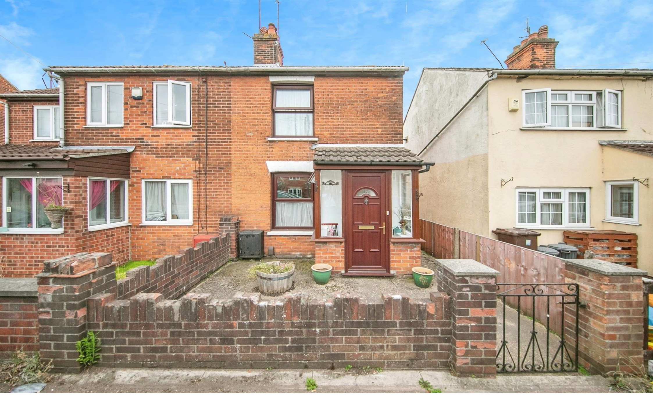
Parsons Heath, Colchester, CO4 3HS