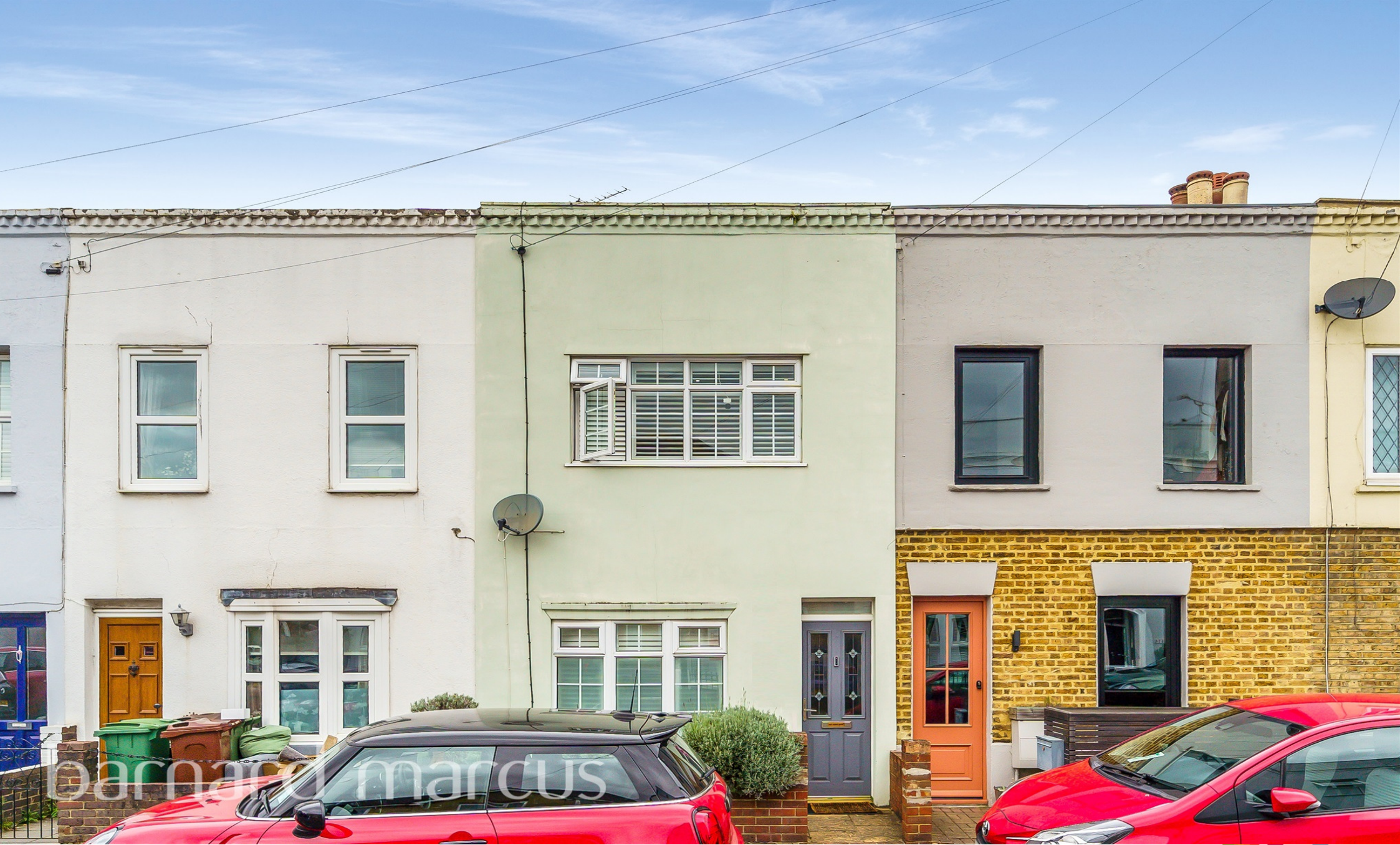
Longfellow Road, Worcester Park, KT4 8BD