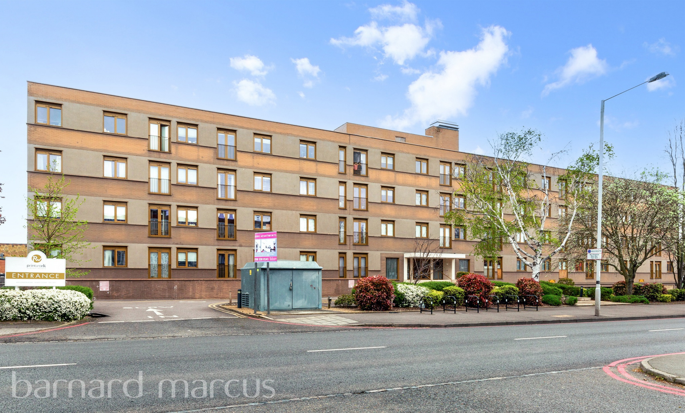
Printwork Apartments, London Road, Cheam, Sutton, SM3 9BN