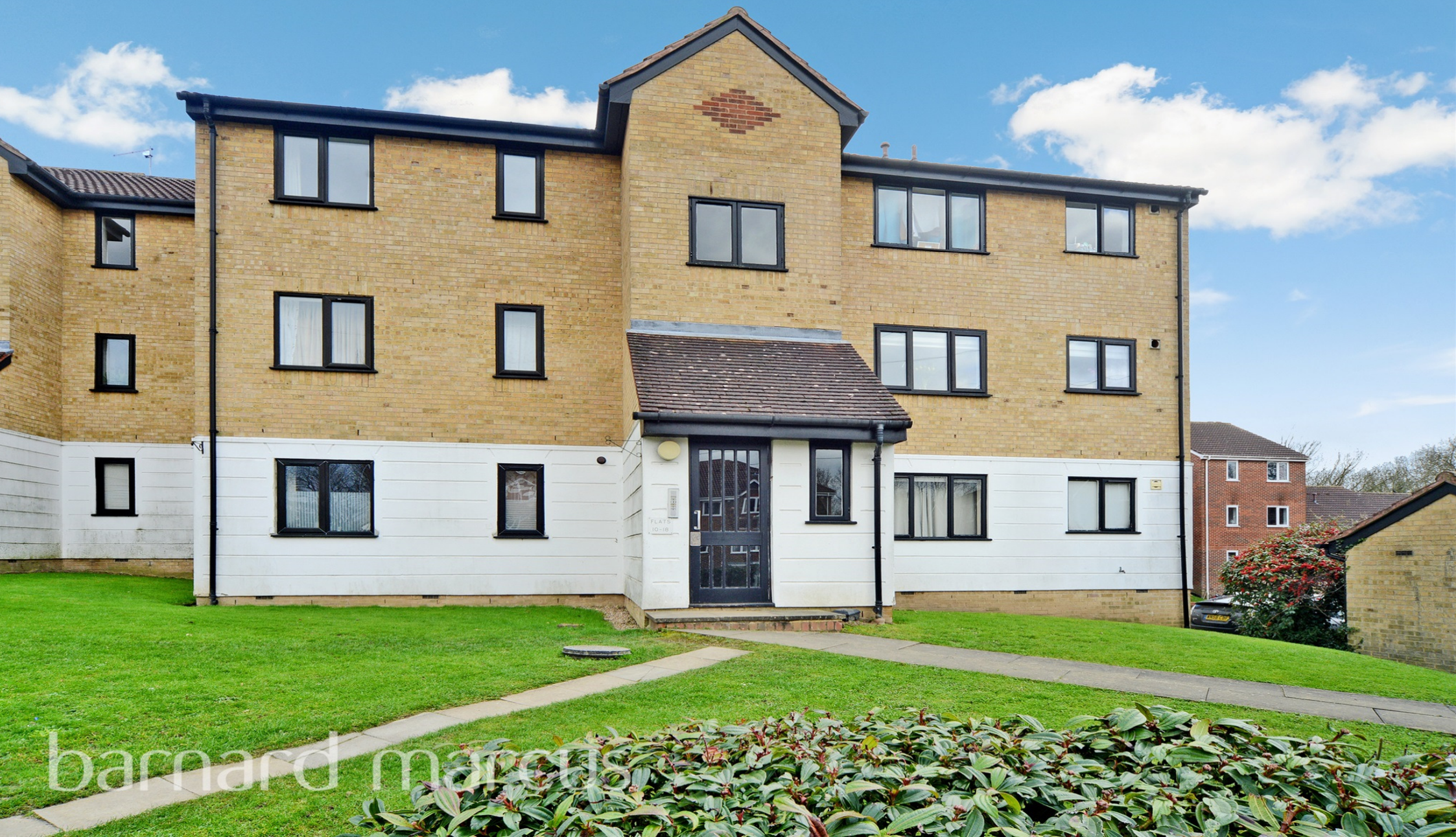
Garnet House, Percy Gardens, Worcester Park, KT4 7SA