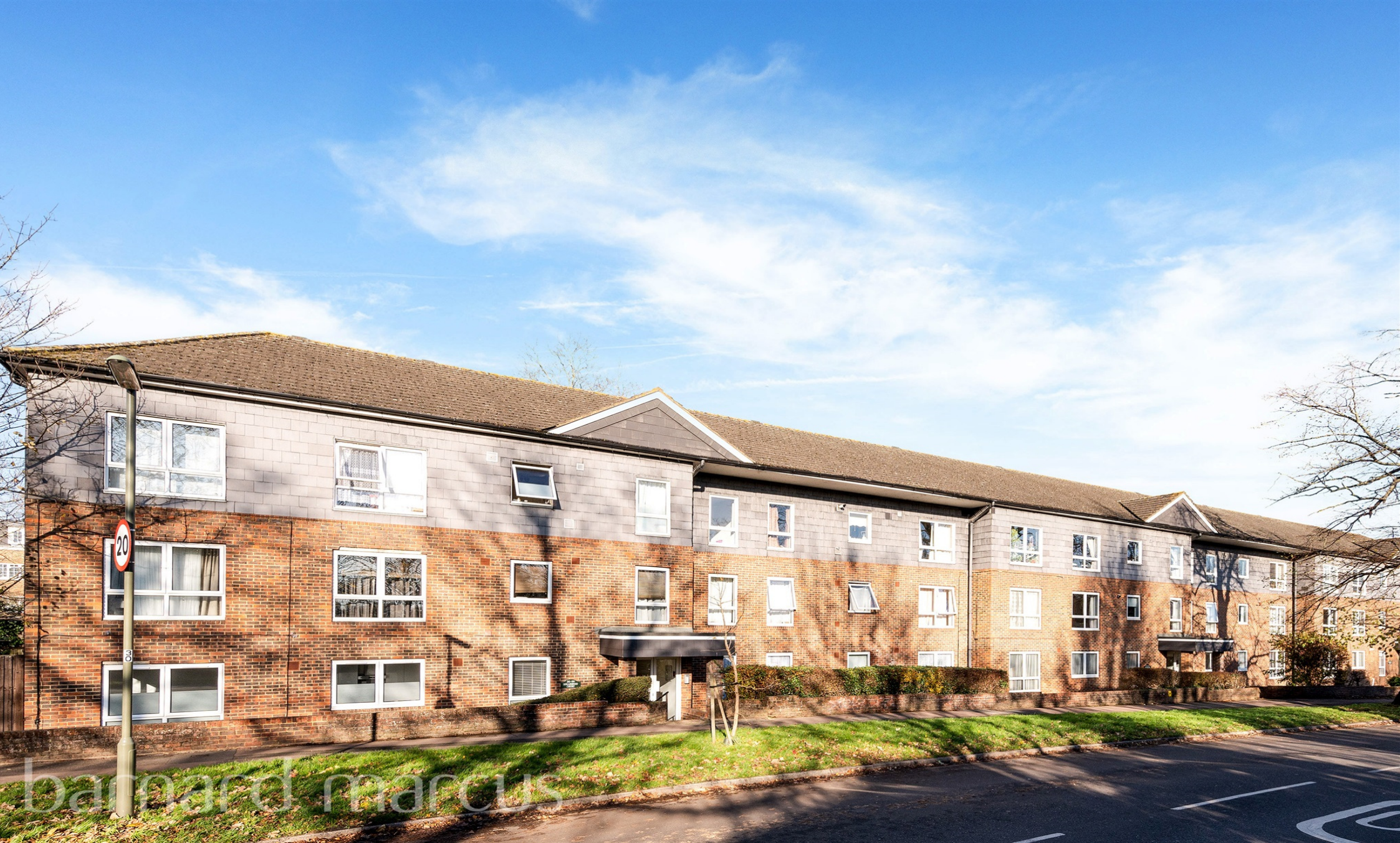
Briarwood Court, The Avenue, Worcester Park, KT4 7EL