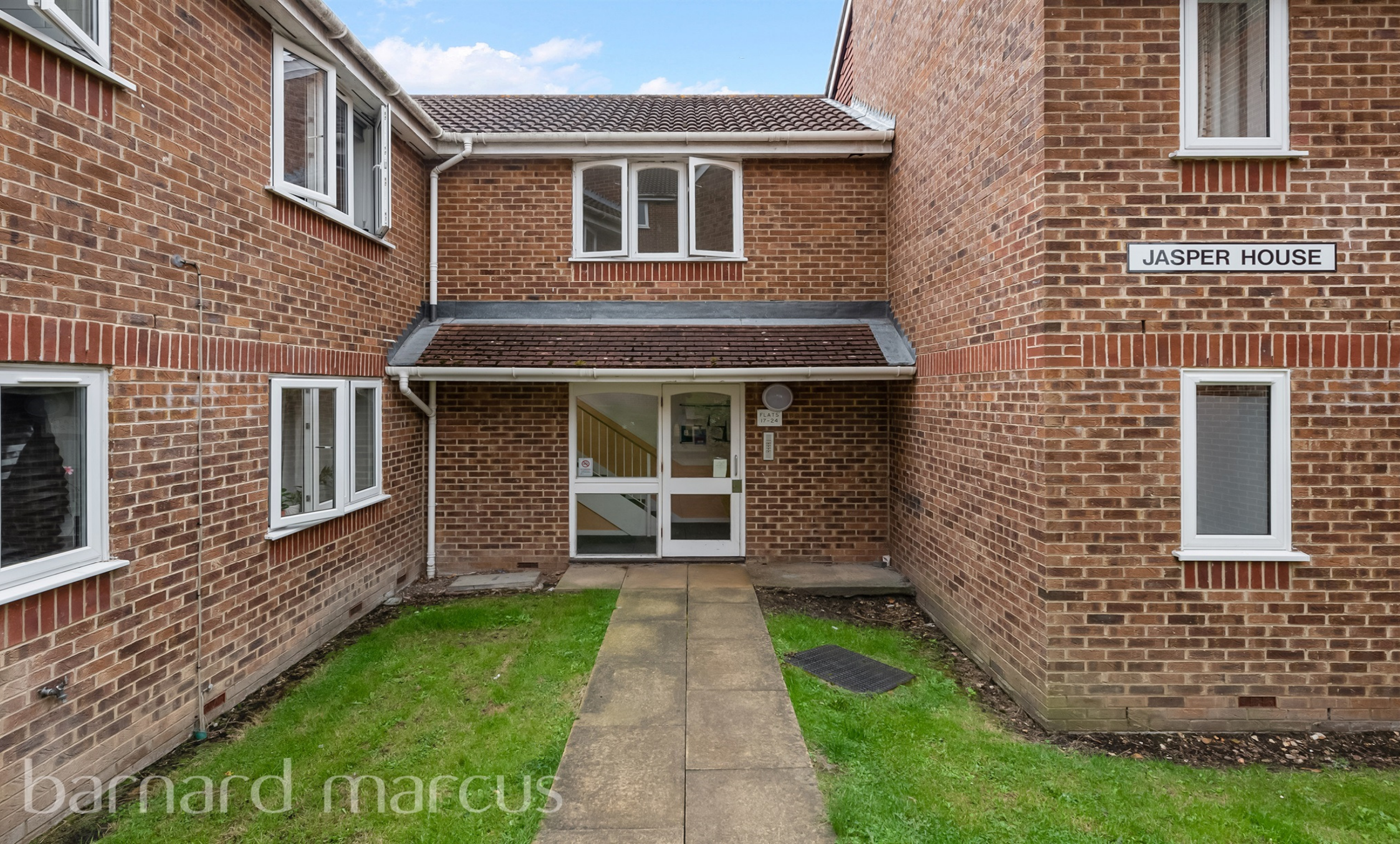
Jasper House, Percy Gardens, Worcester Park, KT4 7SA