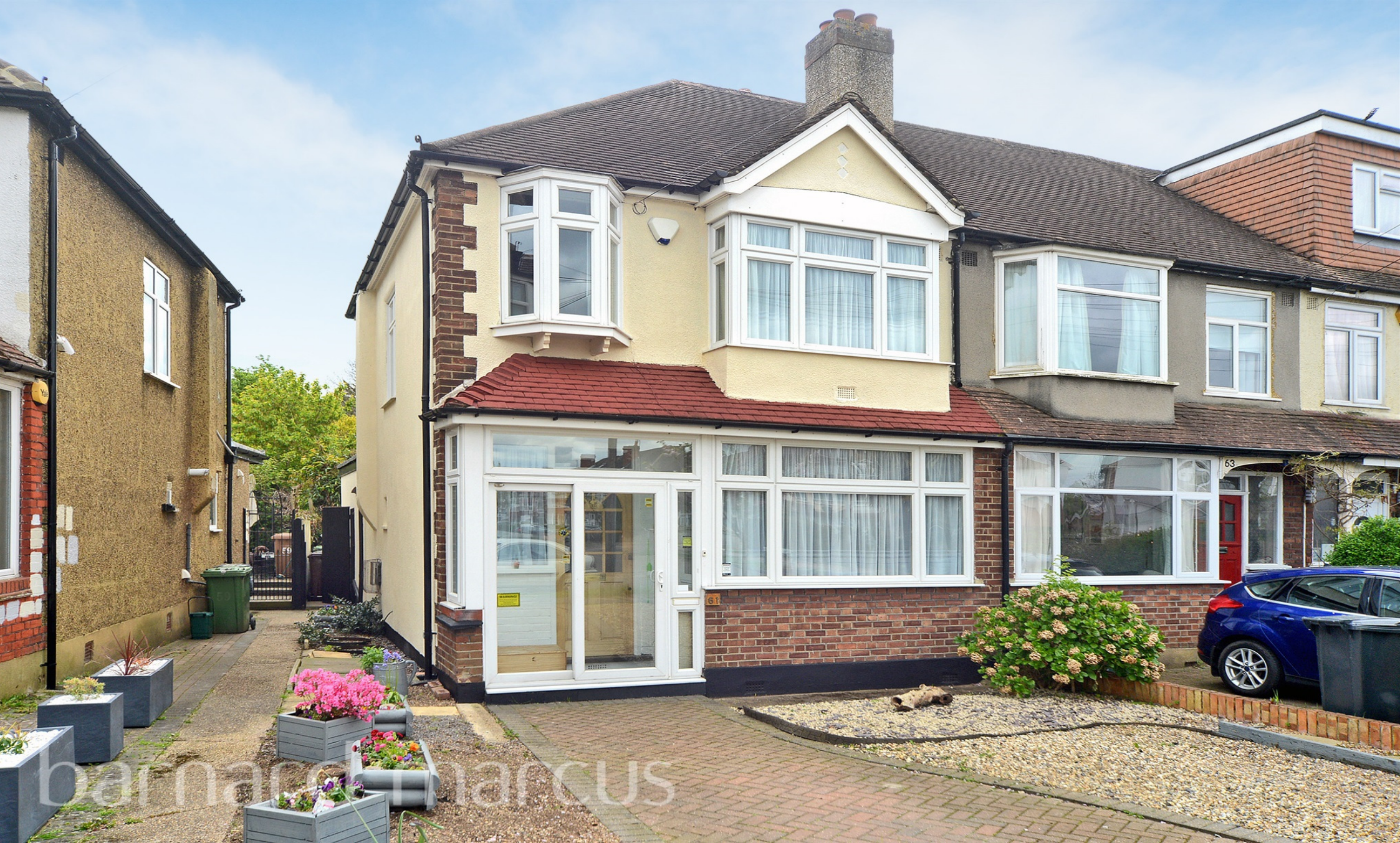
Inveresk Gardens, Worcester Park, KT4 7BB