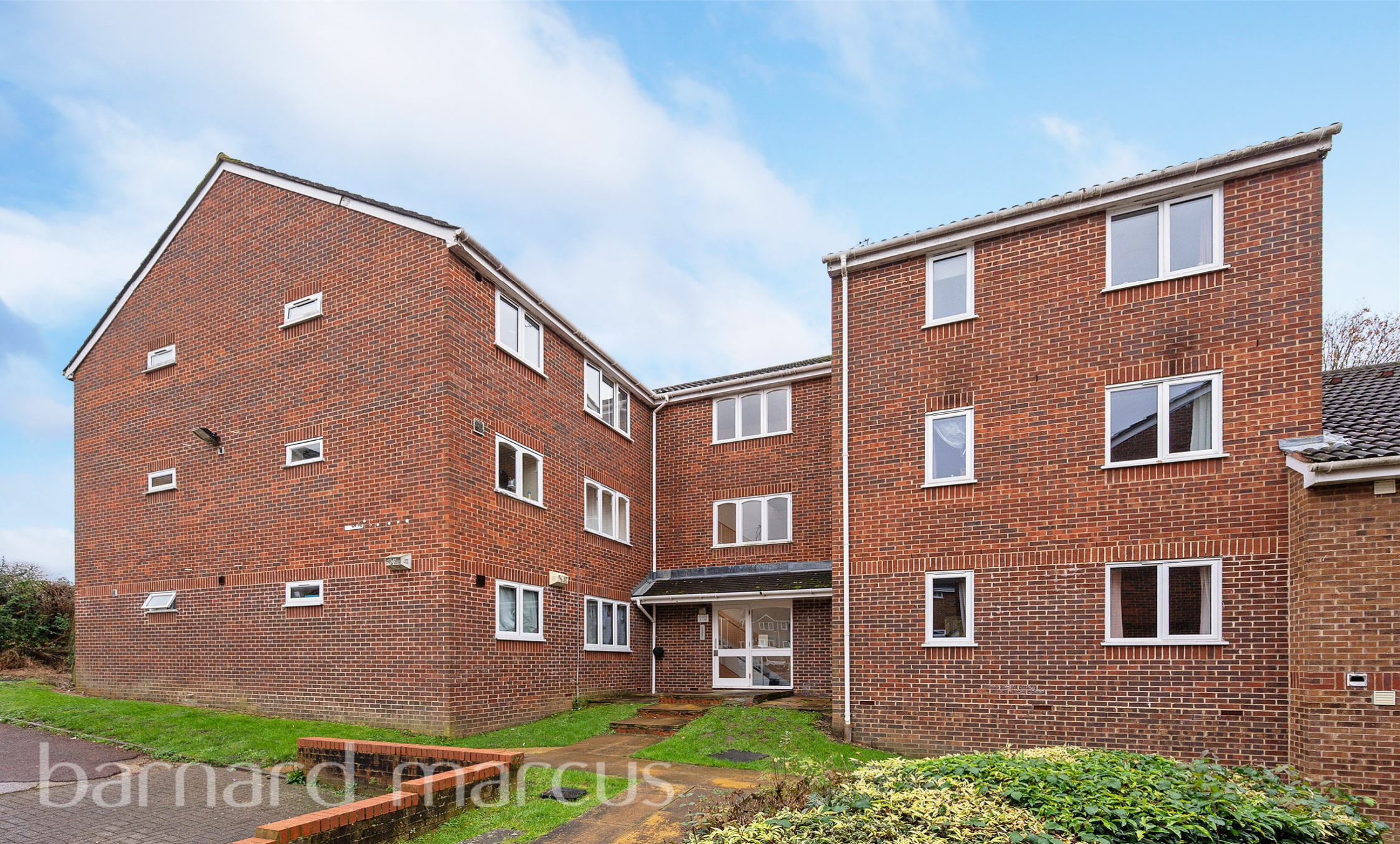
Jasper House, Percy Gardens, Worcester Park, KT4 7SA