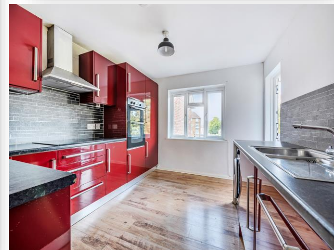
Capel Close, London N20 0QU