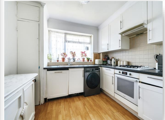
South Mount, London N20 0PJ