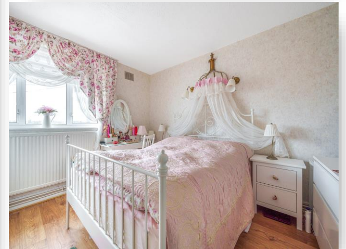
Marshe Close, Potters Bar EN6 5NR