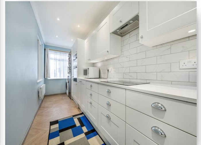
Weirdale Avenue, London N20 0AJ