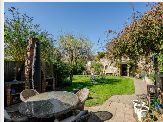
Bedford Avenue, Barnet EN5 2ER