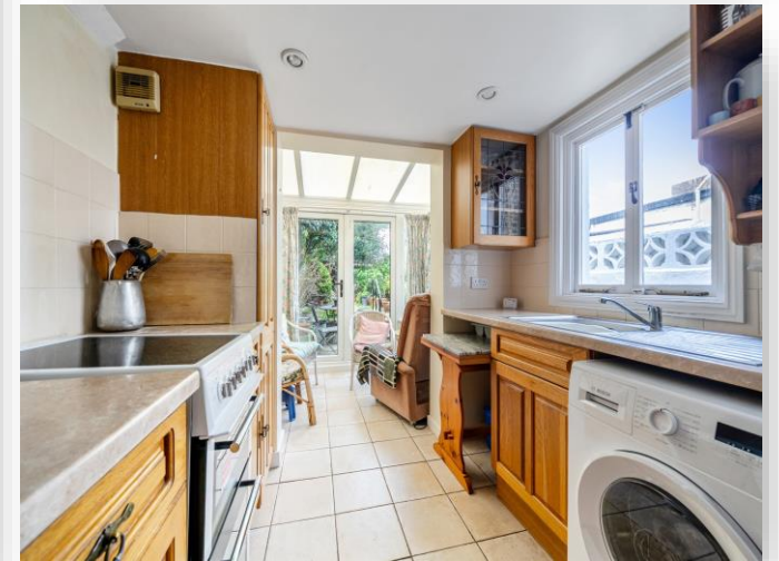
Brunswick Grove, London N11 1ED