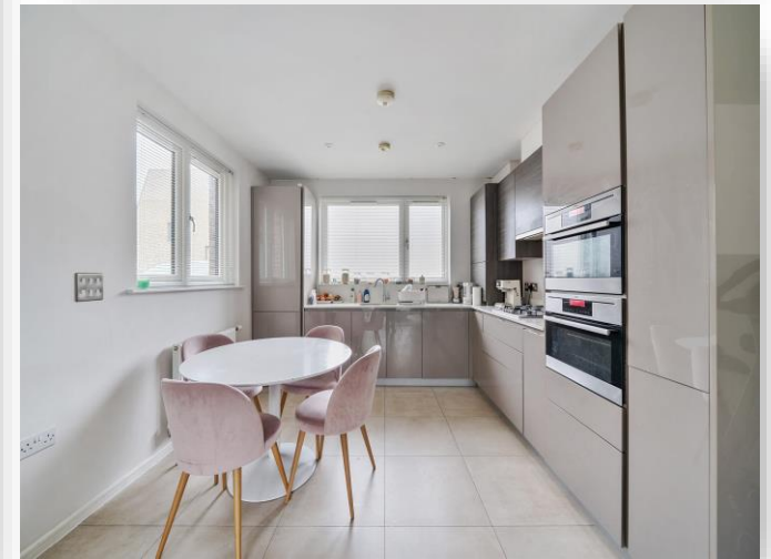
Sphinx Way, Barnet EN5 2FG