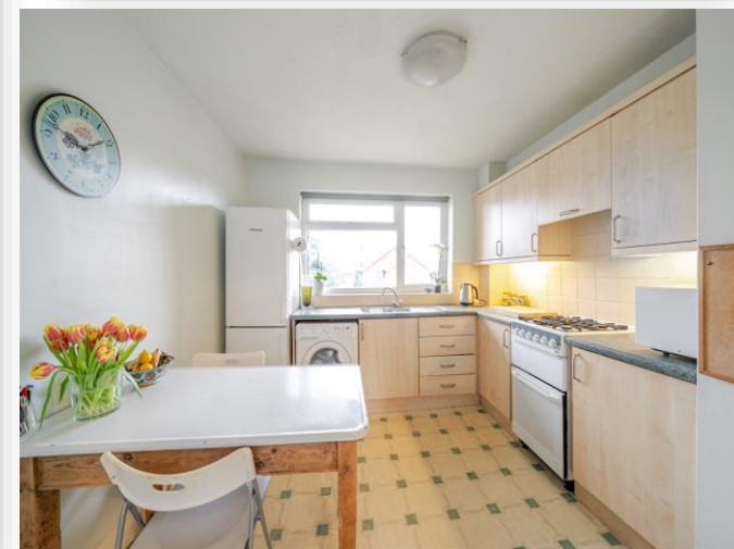
Thatcham Court High Road, London N20 9QU