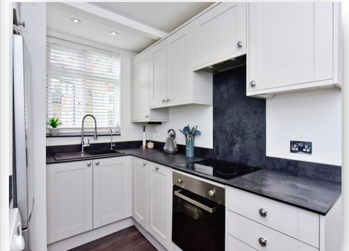
Parkwood Flats Oakleigh Road North, London N20 0RX