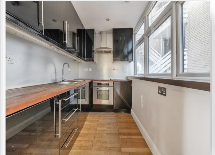
Brookhill Court Cat Hill, Barnet EN4 8HQ