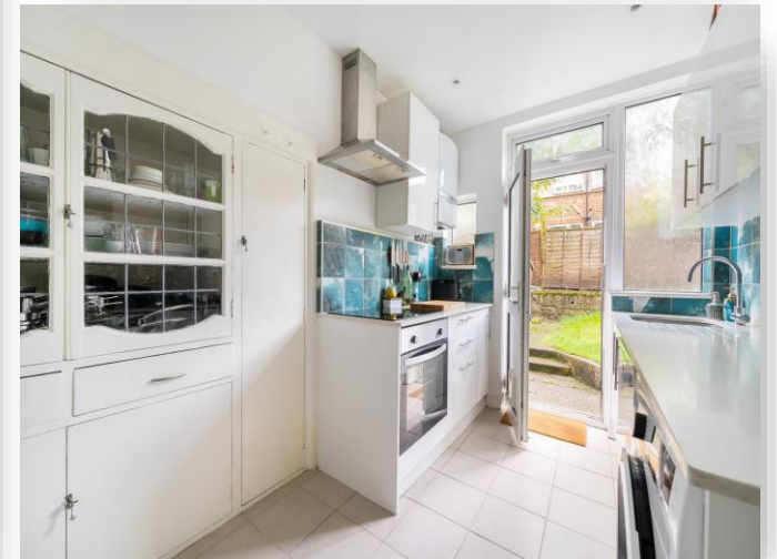
Oakleigh Road North, London N20 0RH