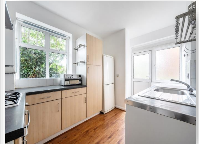
Parkwood Flats Oakleigh Road North, London N20 0RX