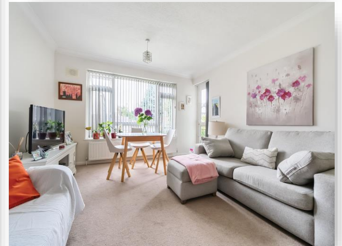
Thatcham Court High Road, London N20 9QU