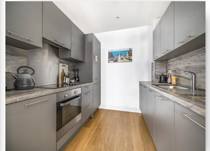
Highbrook House Quayle Crescent, London N20 0DY