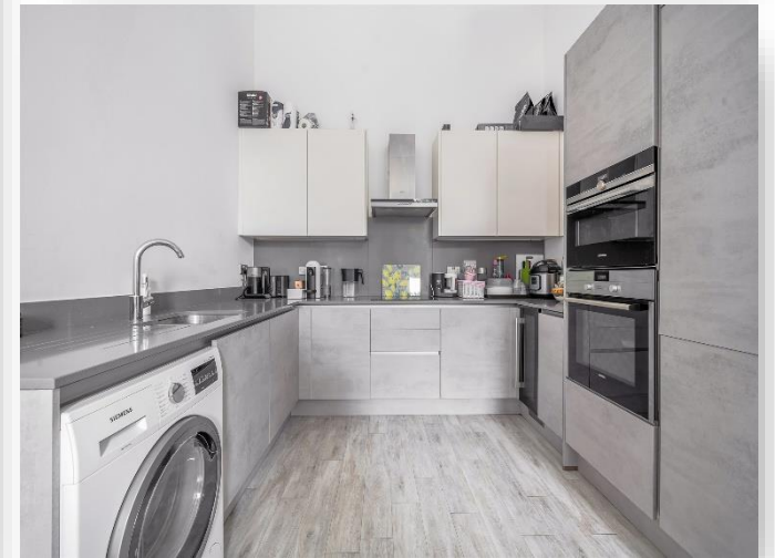
Gladstone House Quayle Crescent, London N20 0ER